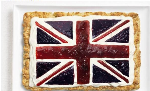
United Kingdom scone, cream and jams