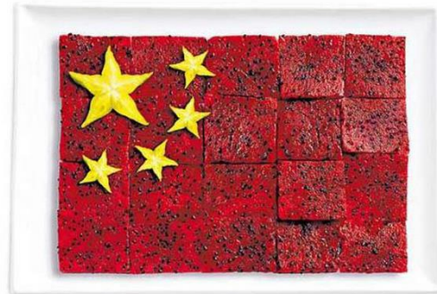
China dragon fruit and star fruit