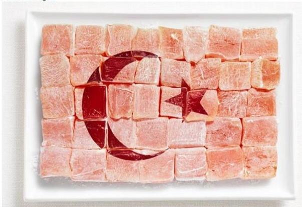
Turkey Turkish Delight