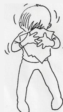
Use a handkerchief

Key workers will be meeting with parents/carers whose children are still in nappies to develop an action plan for toilet training. With the Easter holidays approaching it will be a good opportunity to practice toilet training at home so the children will have a free term of nappies before starting school in September.