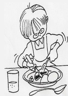
Use a knife and Fork