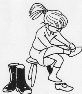
Change shoes and pumps.