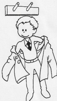
Put on and fasten his/her coat.