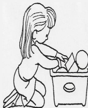
Tidy/ clear away his/her Toys