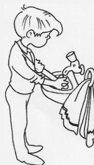
Wash and dry his/her hands and face