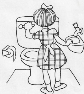
Use the toilet properly and flush it